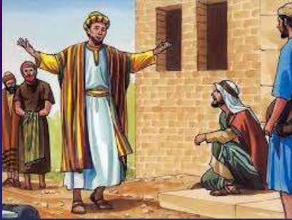
Rich Young ruler