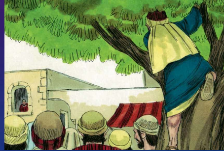
Zacchaeus (the chief tax collector)